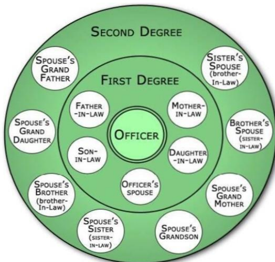
AFFINITY KINSHIP Relationship by Marriage